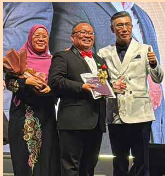
BE THE LEGEND Convention