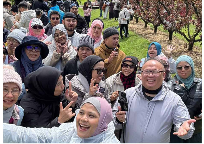
Attended the BE Leadership Meeting

The path, however, required resilience. Building across Sarawak meant travelling long distances, navigating poor road conditions, and enduring physically demanding journeys. "There were times I had to sleep by the roadside," he recalled. Beyond the physical challenges, he encountered individuals who could not read, write, or count. Yet, his greatest concern was never their limitations. "I was afraid they would give up," he said. "So I stayed with them, guided them, and believed in them." His philosophy remained simple: "I don't chase the title. The title will come." And it did, so quietly that he did not even realise when he achieved RCCA.