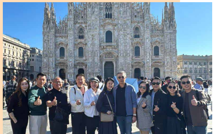
BE Extravaganza Success Travel (BEST) Milan with Founders