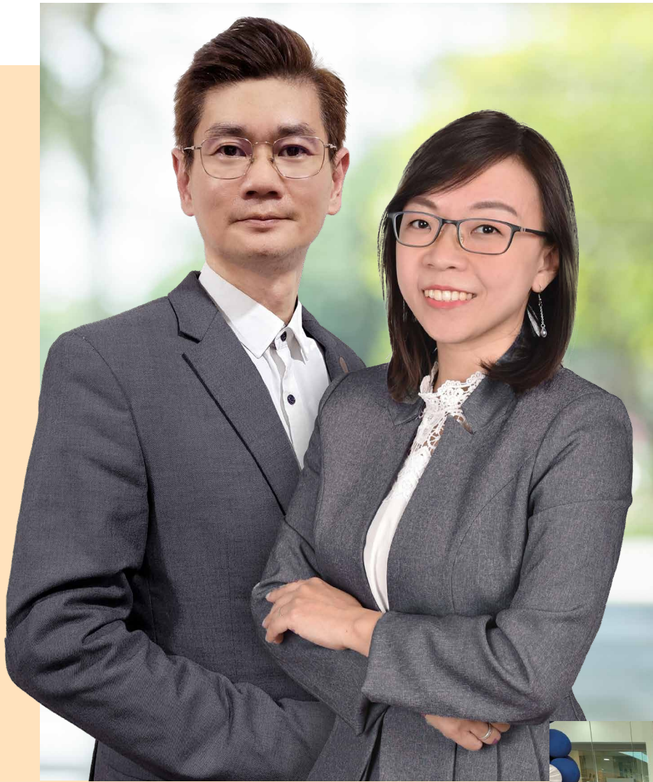
Picture with Founder