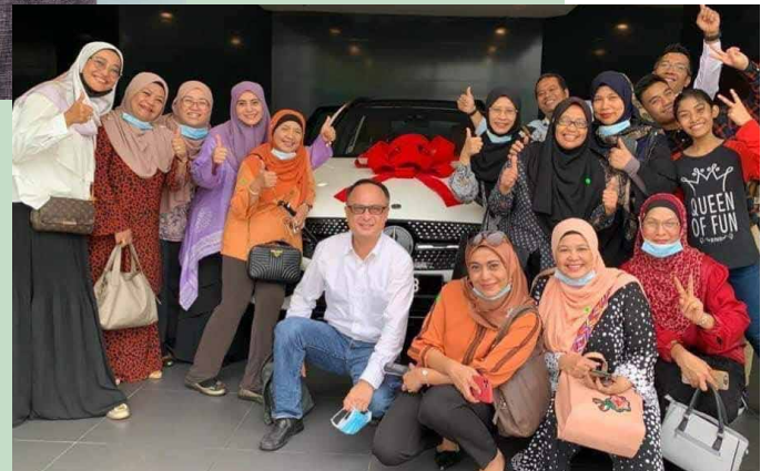
Bought my dream car