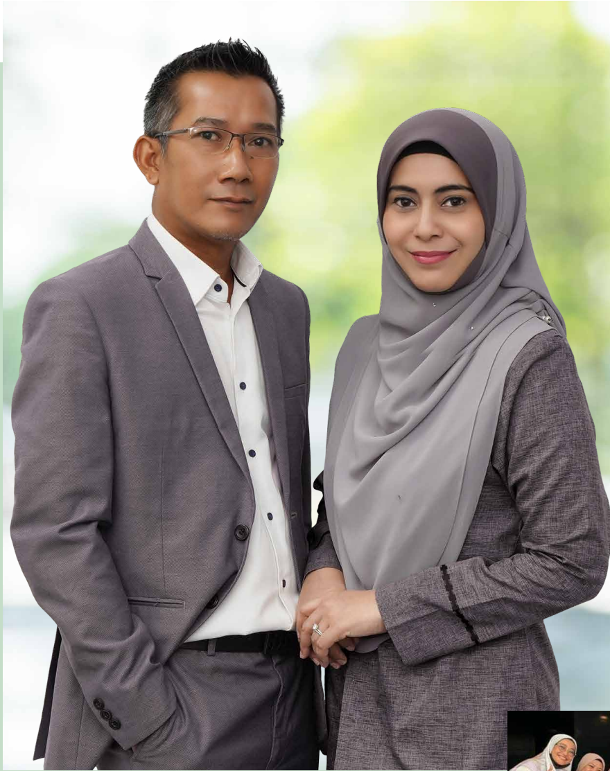
My uplines, mentors and friends