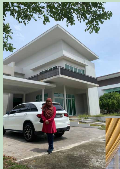
Bought my dream house