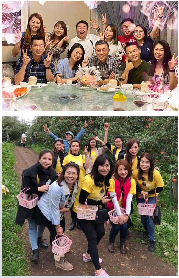
BE Lifestyle Travel to Japan