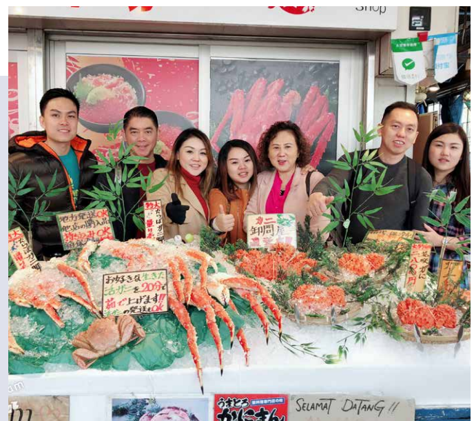
BE Lifestyle Travel to Japan