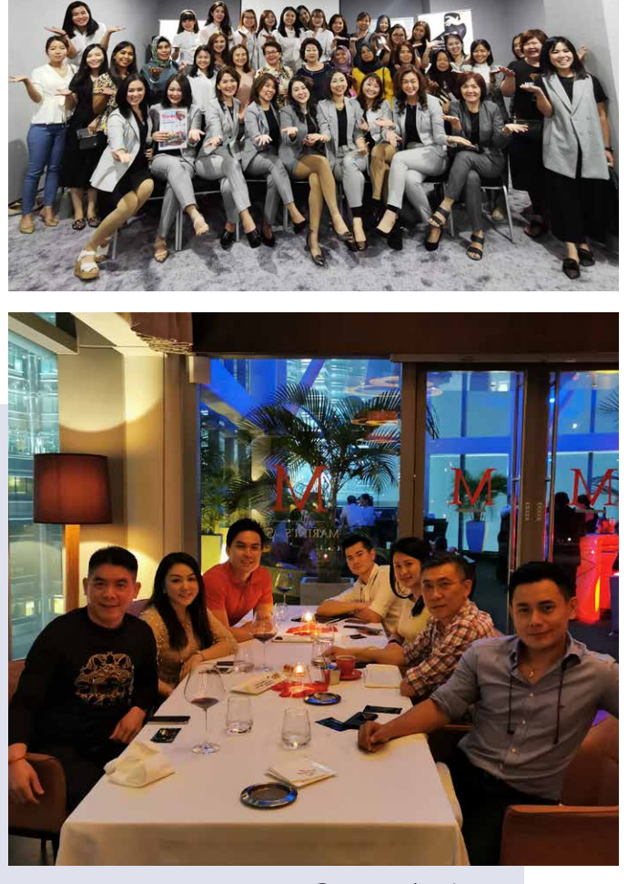
Dinner with upline & founders