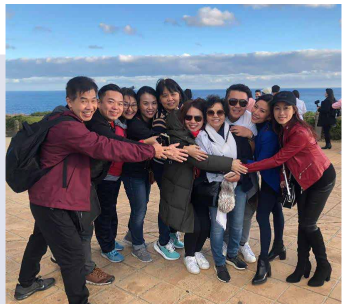
BE Lifestyle Travel to Melbourne