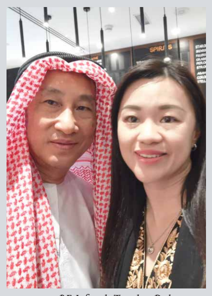
BE Lifestyle Travel to Dubai