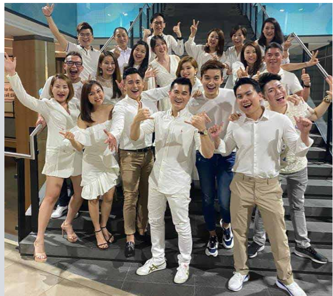
Dinner with upline