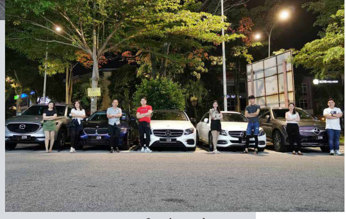
Bought our dream car

One day, I came across my customer's FB posts on Aulora Pants. She was a regular customer and I also noticed her improved complexion and overall health. Although she never told me about Aulora Pants before, when I saw her posts, I decided to buy one,